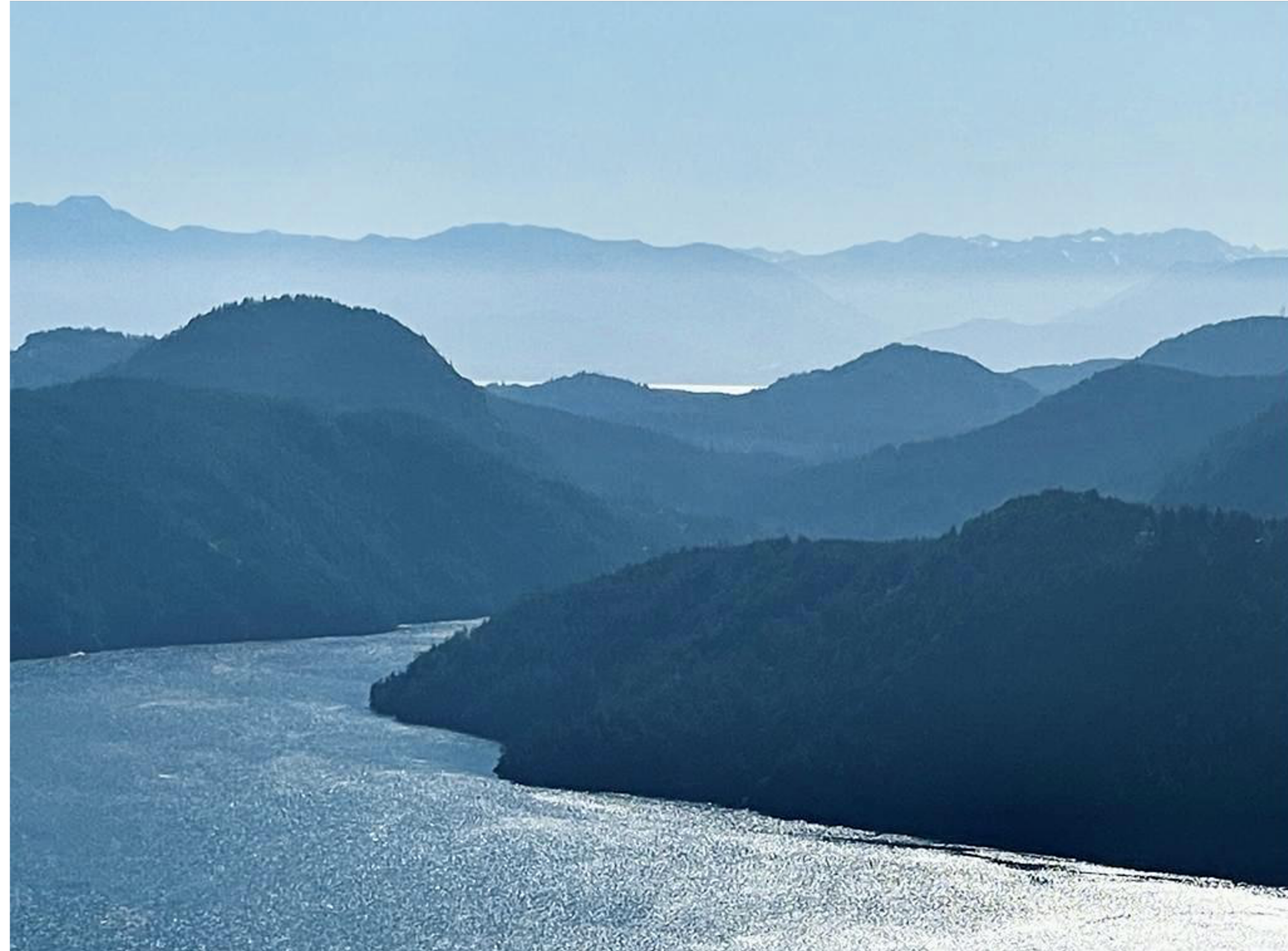
Photo: Saanich Inlet from Malahat