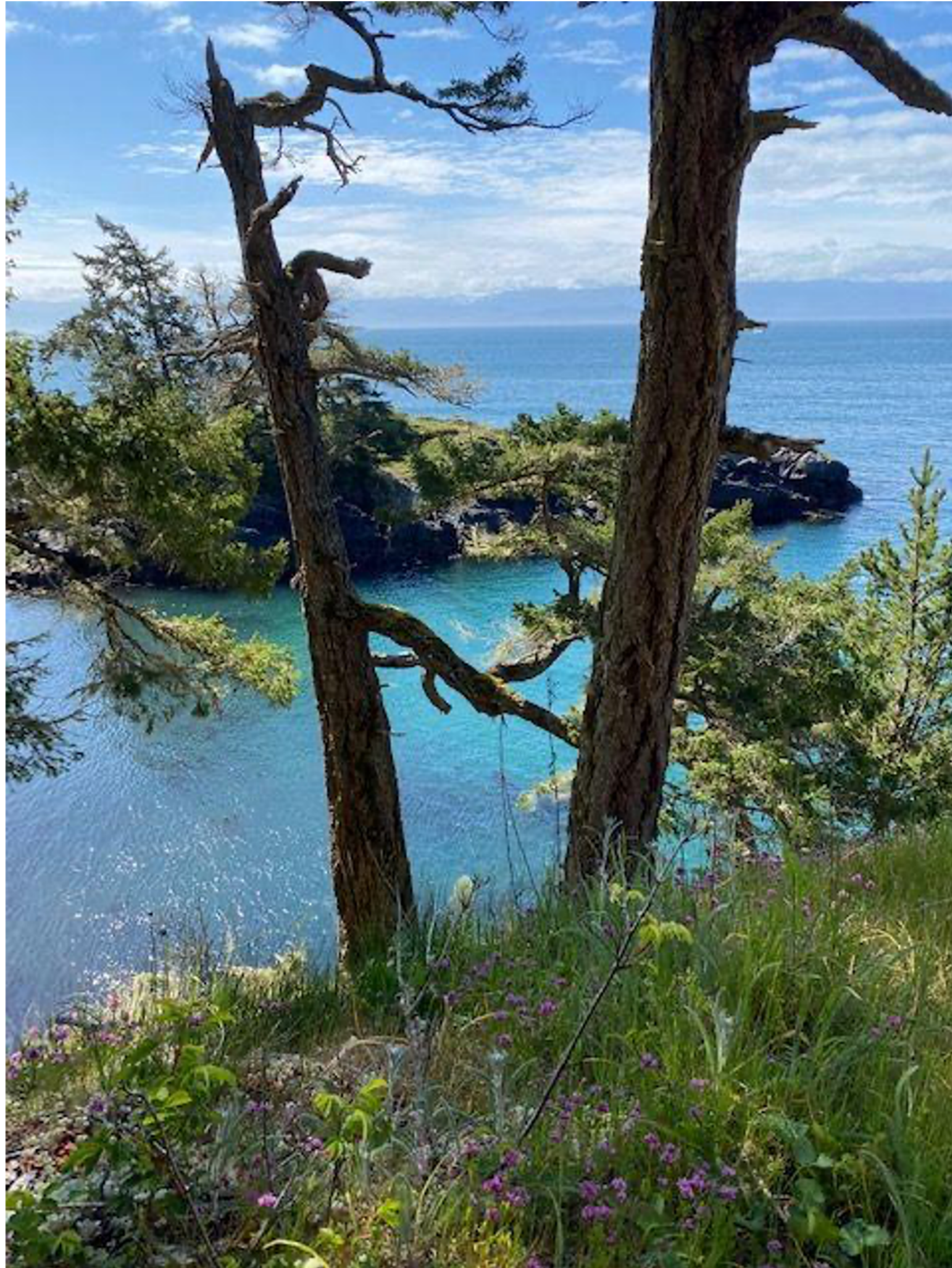
Photo East Sooke Park Iron Mine Bay